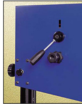
Quick-Release Saw Blade Changing System