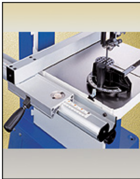
Easy read-out magnifying scale and alloy extruded rip fence