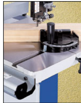
Optional Miter Gauge for Angle Adjustment.