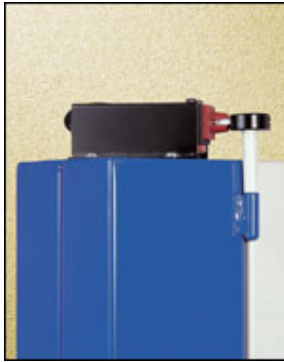
Auto power off switch (CE)