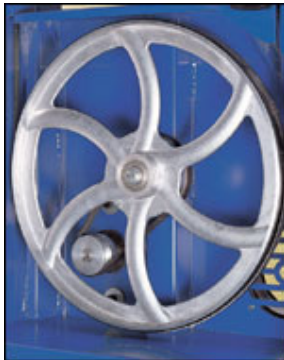
Non-Slip groove belt for smooth operation