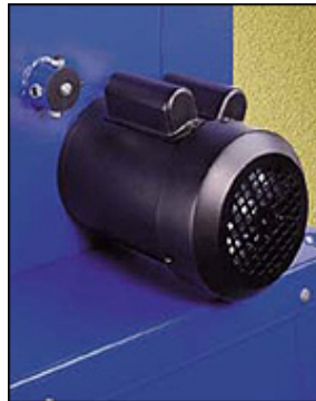
1.Powerful 4" Dust Chute to Collect 98% Wood-Chip in Workshop 2.Powerful Induction Motor