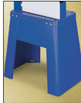
Standard Deluxe Heavy-duty Stand.