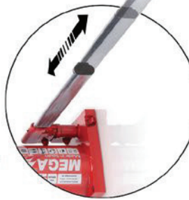
Telescopic three piece zinc plated pump handle.