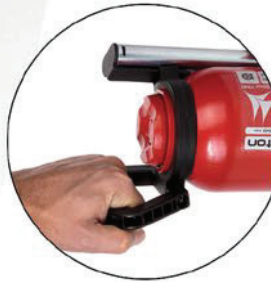
Rotatory carrying handle from BR20 onwards.