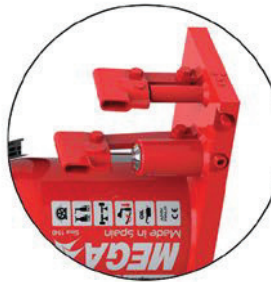
The BRD50 and BRD100 jacks are fitted with two pumps (approach and operation).